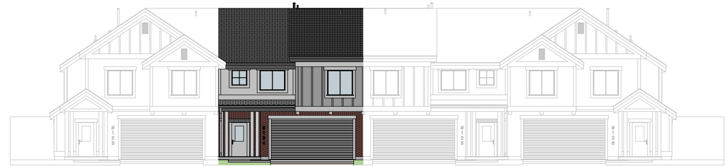
[ Front Elevation ]